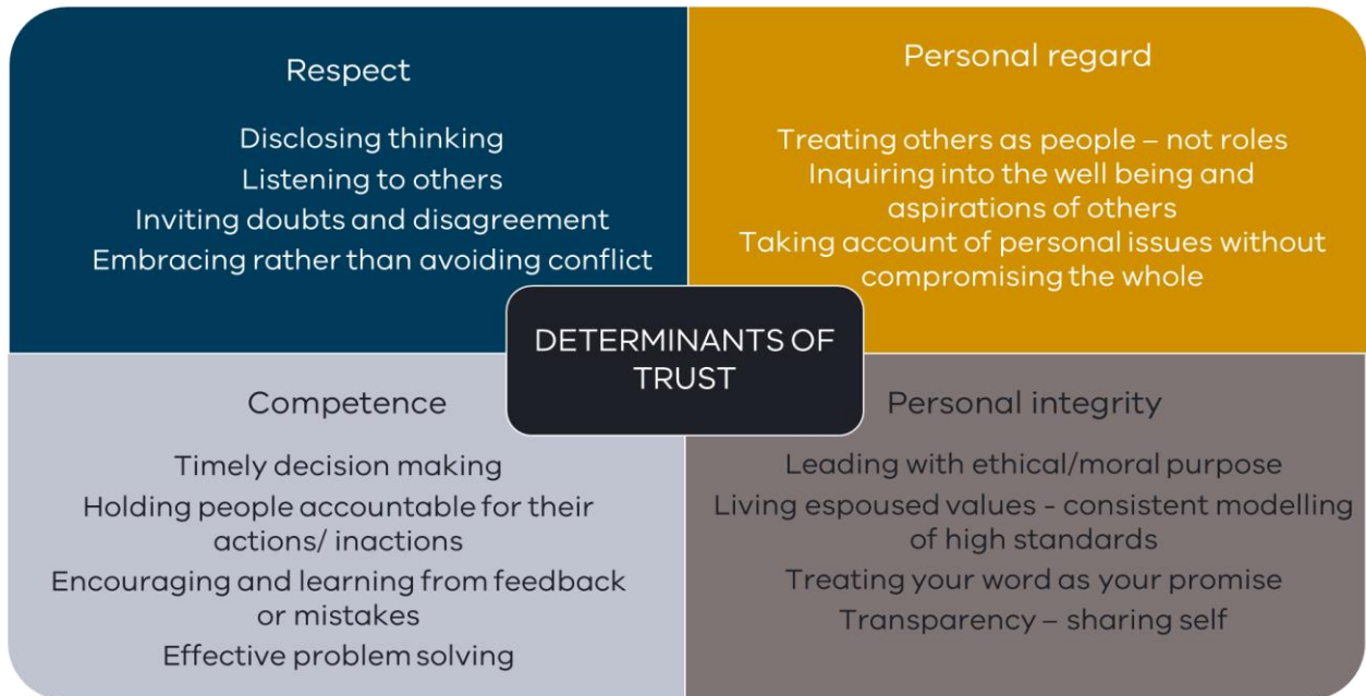
Figure 2 – Determinants of trust, based on the work of Bryk & Schneider, 2002

The four determinants suggest trust is built through the skilful integration of factors to strengthen relationships (being respectful and having integrity) while progressing the tasks important to the achievement of organisational goals (role-related competence).